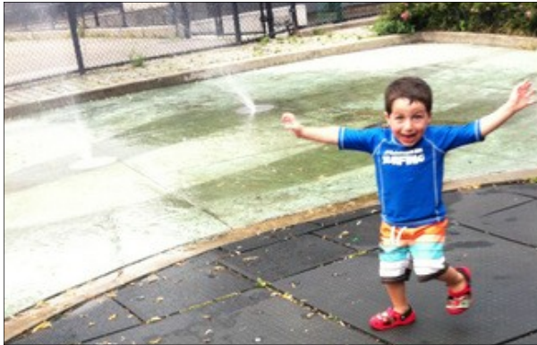
Water Fun & Outdoor Playground