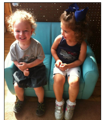
Klub 4 Kidz